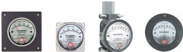
Flush, Surface or Pipe Mounted

A single case size is used for most models of Magnehelic® gages. They can be flush or surface mounted with standard hardware supplied. Although calibrated for vertical position, many ranges above 1" may be used at any angle by simply re-zeroing. However, for maximum accuracy, they must be calibrated in the same position in which they are used. These characteristics make Magnehelic® gages ideal for both stationary and portable applications. A 4-9/16" hole is required for flush panel mounting. Complete mounting and connection fittings, plus instructions, are furnished with each instrument. See pages 6 and 7 for more information on mounting accessories.