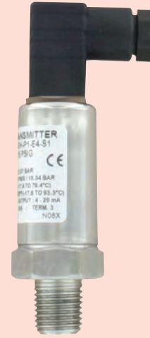
General Purpose Housing (-GH) with DIN C